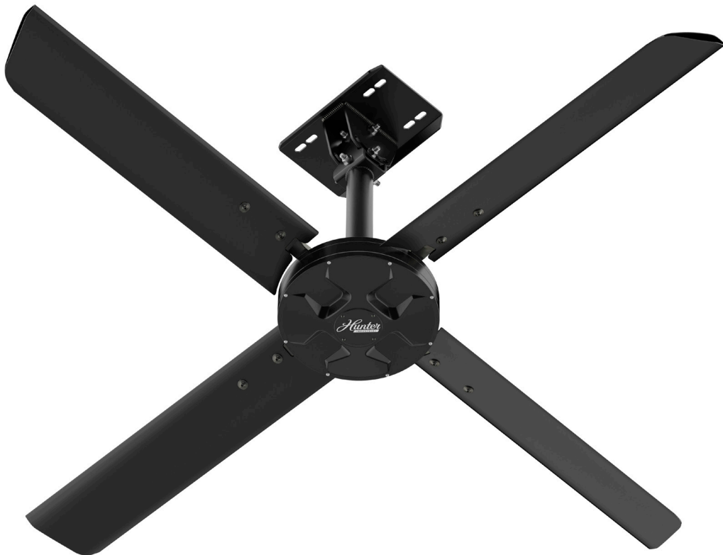
(XP 8FT Fan pictured above)