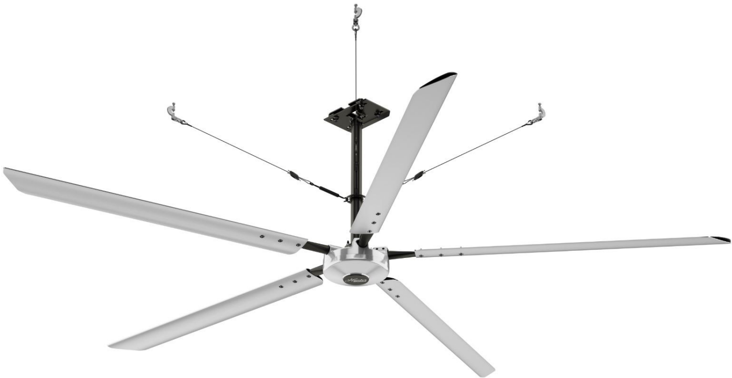
(TITAN 14FT Fan pictured above)